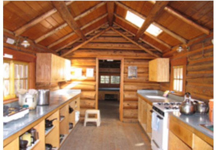
Interior of Elizabeth Parker Hut

There is a wood-burning stove in the main cabin, and another in the Wiwaxy Cabin during winter months only. Firewood is stored behind the outhouse. Please replace all firewood you use in the hut with cut and split wood from the pile.