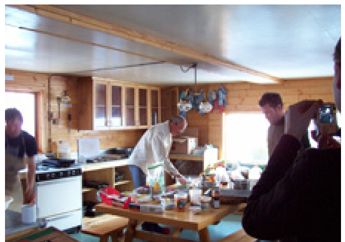
Bill Putnam Hut interior by Bori Shushan

The hut is heated by a wood-burning stove. Firewood is stored behind the hut. Please replace all firewood you use in the hut with cut and split wood from the pile.